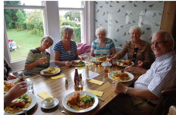
Lunch at Turf Lock